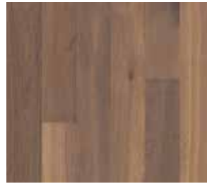
CAPPUCCINO OAK OILED CAS1478SU MARQUANT