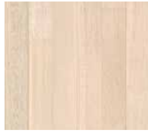
POLAR OAK MATT CAS1340SU NATURE