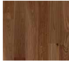
NOBLE WALNUT SATIN CAS1356 NATURE