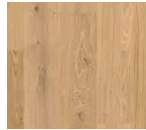
PURE OAK MATT IMP1623SU MARQUANT