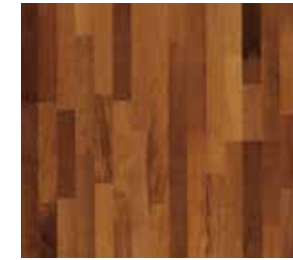
MERBAU BRIGHT VIL3488SU* NATURE