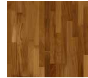
IROKO BRIGHT VIL3487SU NATURE