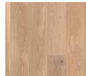
DUNE WHITE OAK OILED PAL1473SU NATURE