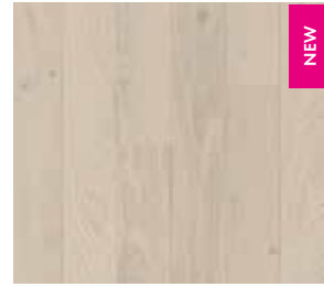
LUSTER OAK EXTRA MATT CAS4011SU MARQUANT