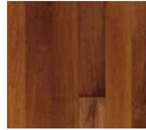
MERBAU BRIGHT CAS3488SU NATURE