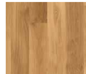
HONEY OAK OILED PAL1472SU NATURE