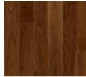
SWEET WALNUT SATIN CAS3444SU MARQUANT