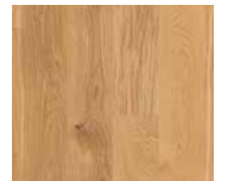
NATURAL MYSTIC OAK MATT PAL1336SU NATURE