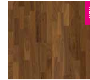
GINGER BROWN WALNUT BRIGHT VIL4010SU MARQUANT