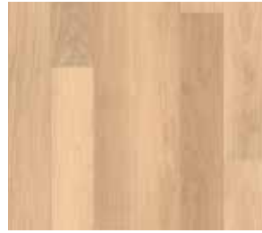
PURE OAK MATT CAS1341SU NATURE