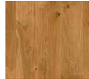
NATURAL HERITAGE OAK OILED IMP1624SU MARQUANT