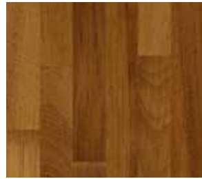
IROKO BRIGHT CAS3487SU NATURE